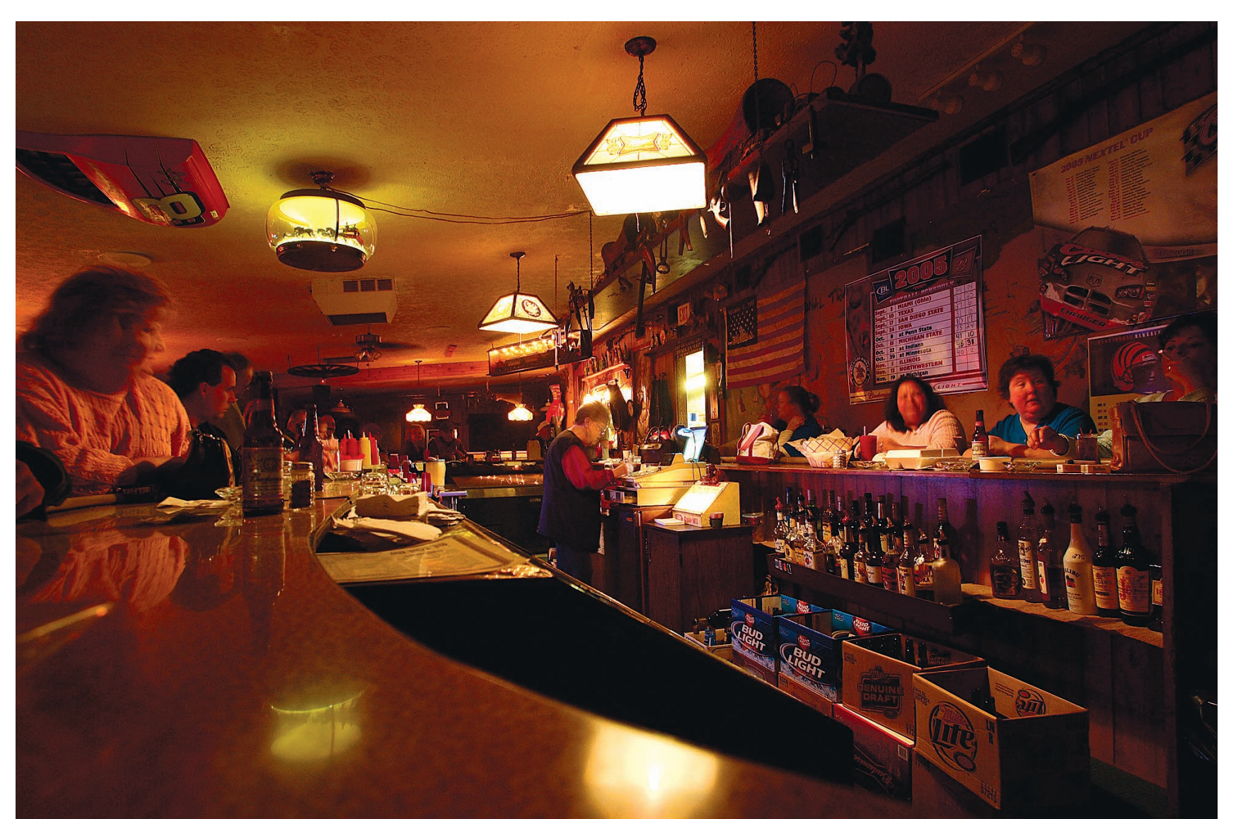
The Old Trail Inn on W. Broad Street: "It's the best place to come for loving abuse," according to a regular customer.