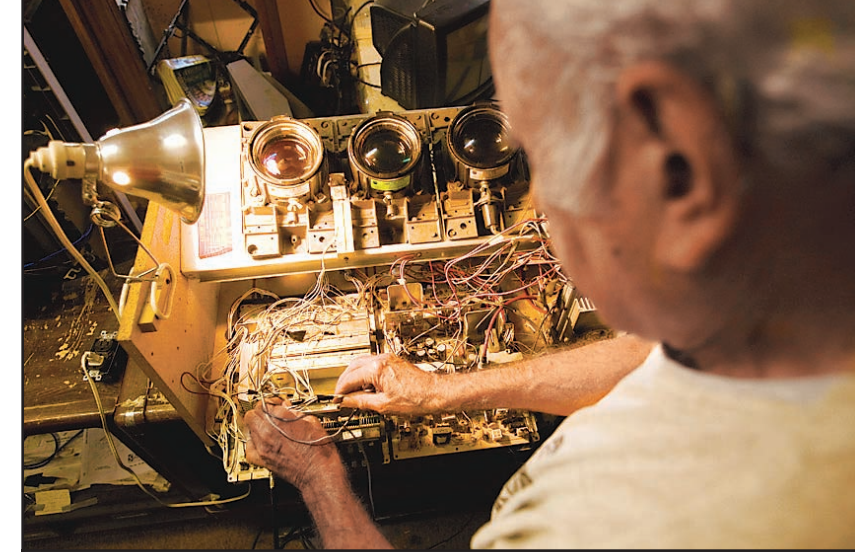
Harmon on modern televisions: "They're all pretty much the same."

Amid a sluggish economy, business has picked up for the 74-year-old Korean War veteran — who